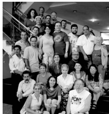
LTC participants, San Nicolás, Argentina

When the chalice was finally extinguished in San Nicolás, there was a common feeling of a vibrant, emerging UU movement in Latin America, a continent full of possibilities and which is ripe for the liberating, non-dogmatic message of Unitarian Universalism.