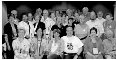
U+U worship attendees

Over 35 Unitarians and Universalists from around the world attended, and the ICUU was present with a booth of its own at the exhibitors' hall. This booth soon became a meeting point for U+U participants, as well as an important source of information for some who had heard about Unitarianism before or who were totally ignorant of our movement. Also, 24 Unitarians and Universalists gathered for a multicultural U+U worship service during "communities night", a time devoted to religious communities gathering separately with their local counterparts.